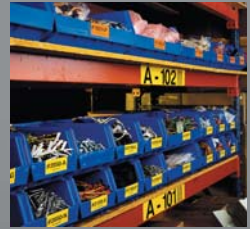
HandiMark® Portable Label Maker prints widths up to 2"

The HandiMark® Portable Label Maker lets you create custom labels wherever you need them – in the office, throughout the plant, or even in the field – all on-the-spot and at a fraction of the cost of custom printed or engraved labels.