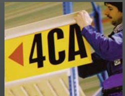
PowerMark® Sign and Label Maker prints widths up to 10"

With the PowerMark® Sign and Label Maker, you can print multi-color signs and labels up to 10" wide for big, bold messages that increase safety and improve productivity throughout your facility.