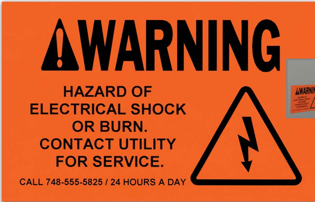
This 4" x 6" sign costs just $0.63 USD/$0.79 CDN printed with MiniMark (Actual Size)