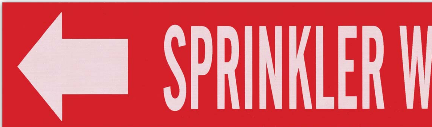
This 2-1/4" x 12" pipe marker costs just $0.94 USD/$1.18 CDN printed with MiniMark (Actual Size)