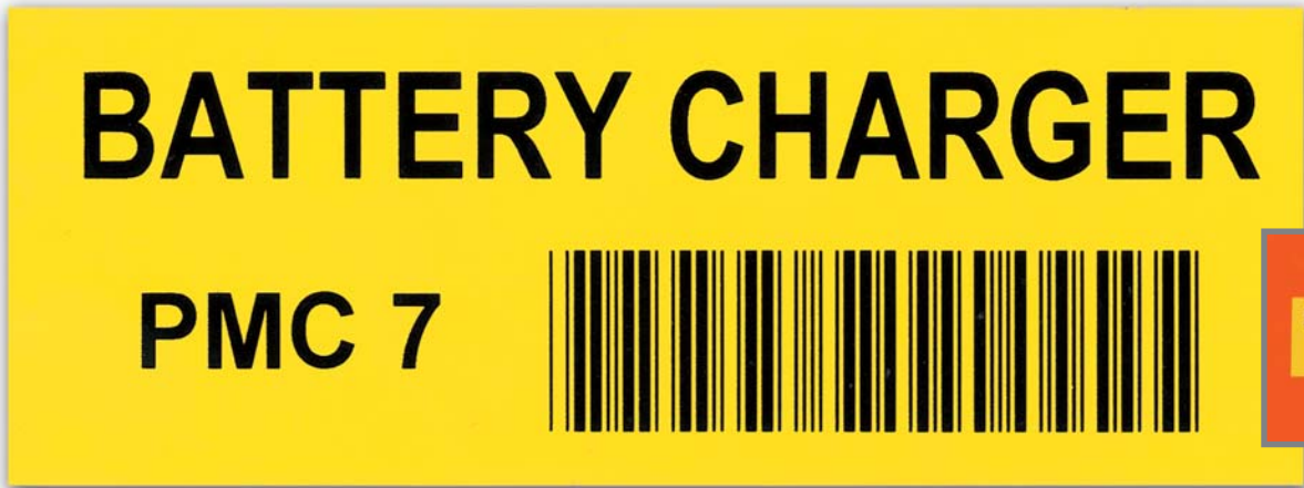
This 2-1/4" x 6" label costs just $0.47 USD/$0.59 CDN printed with MiniMark (Actual Size)