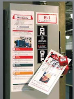
GlobalMark™ Industrial Label Maker prints widths up to 4"

The GlobalMark™ Industrial Label Maker offers multi-color signs and labels, and die cut shapes and letters up to 4" wide – just touch the screen, print, and your label is ready to go. Available in MultiColor, MonoColor, and Color & Cut systems for the flexibility and features you need.